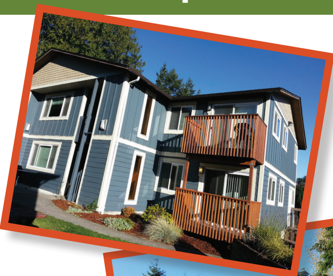
Salisbury Court Juanita, Kirkland