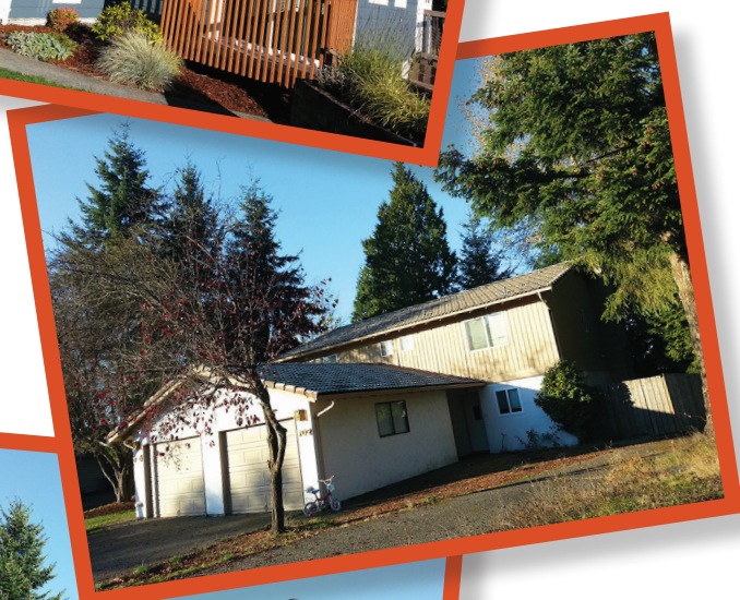
Windermere House Bellevue