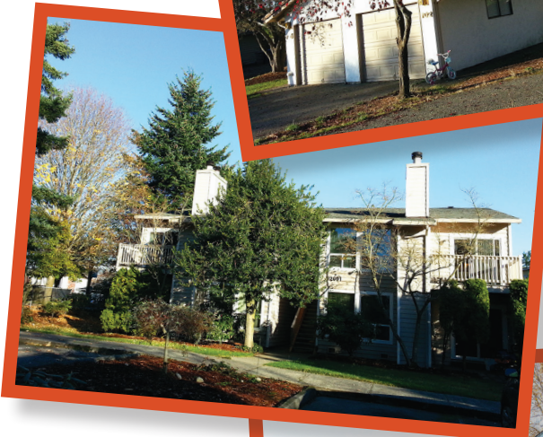
Kirkland Fourplex Rose Hill