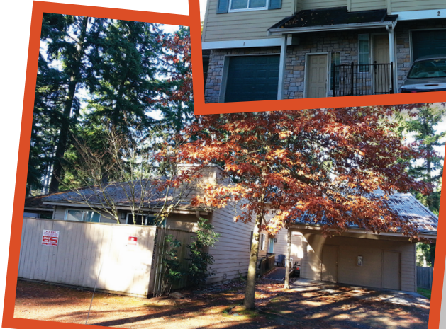
Petter Court Kingsgate, Kirkland